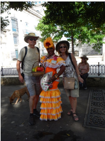
The natives are so friendly!!!!