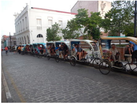
One of the few forms of “public” transportation..... “Madame, your carriage is waiting”.....