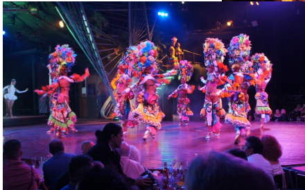
Let’s not forget the entertainment at the Tropicana which most of the group went to see.....