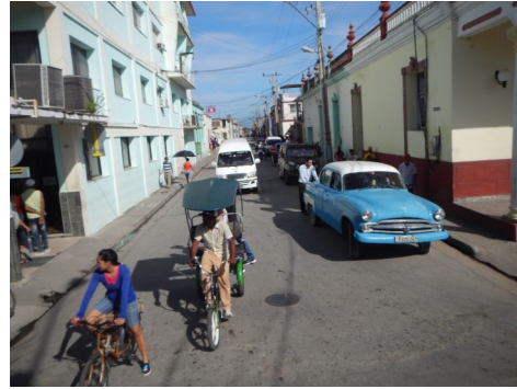
The “Streets ....”