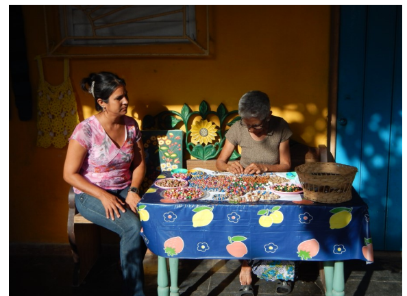
..... AND industrious!!