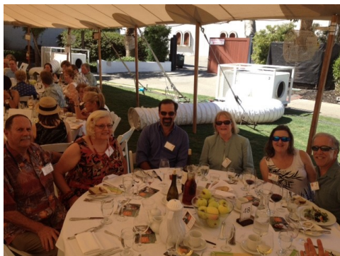
CVSC members at Alameda County Food Bank auction.