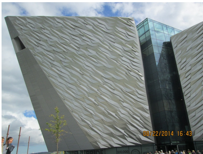
Where the Titanic was built .....