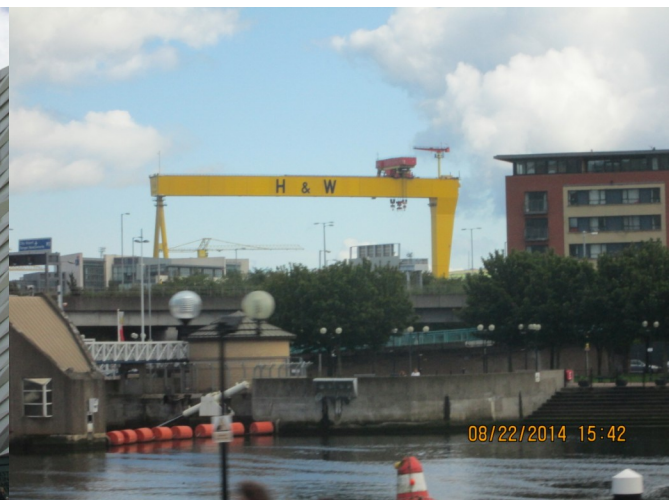
the hoist/crane that helped to build it.