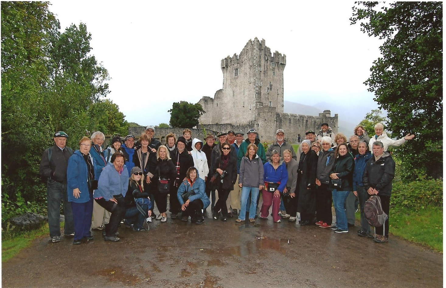
Standing in front of the Ross Castle in Killarney, Ireland