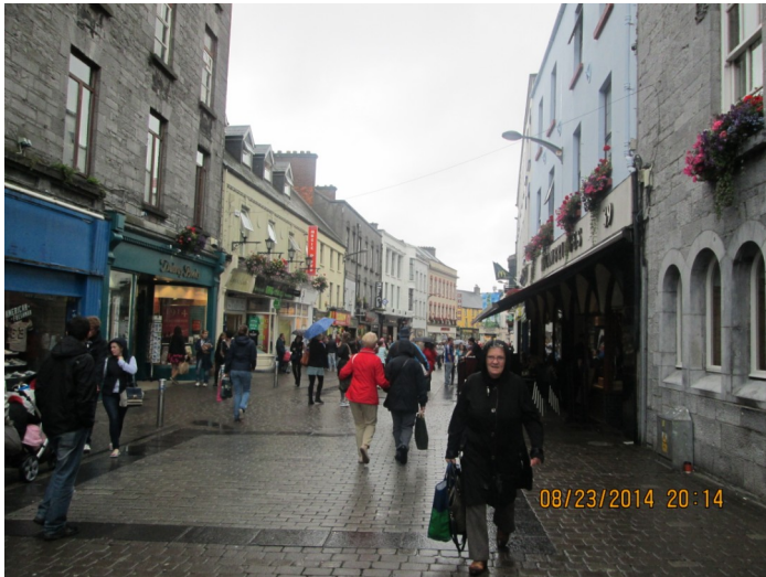
“The Streets of Ireland”