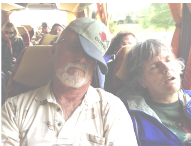
Traveling can be soooooo EXHAUSTING!!!!