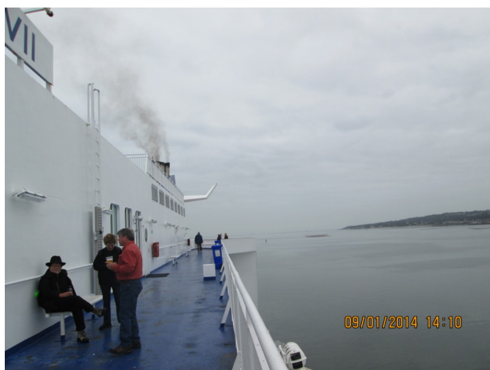
Leaving Ireland... on a ferry to Scotland.