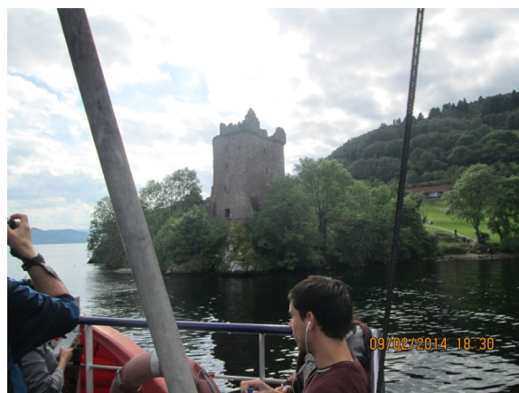
Cruising down the Loch Ness. (no, "Nessy" did not make an appearance!)