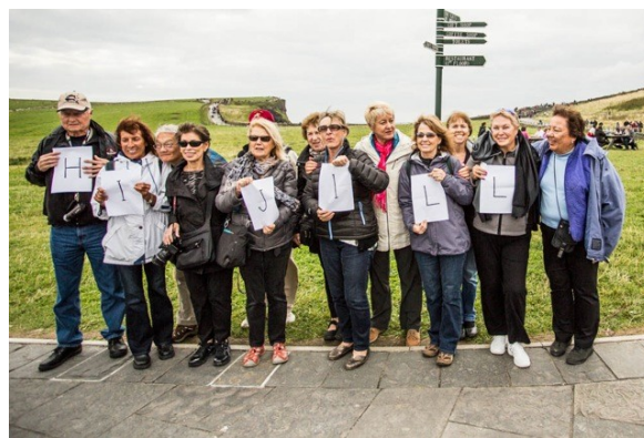
A message to someone back home.