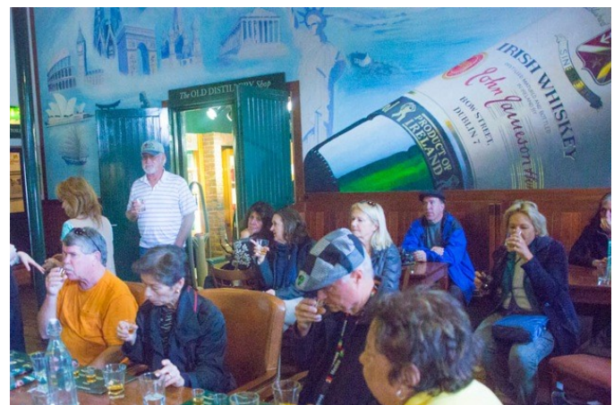
Best parts of the Ireland trip — touring the Guinness Brewery and the Jameson Whiskey Distillery