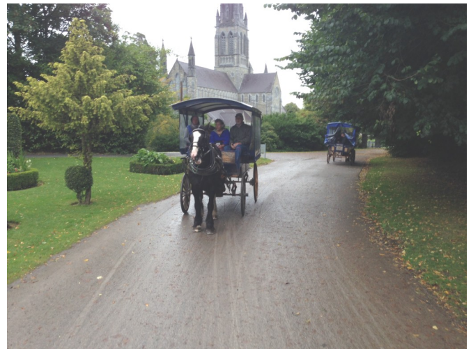
A ride in the jaunty cars.