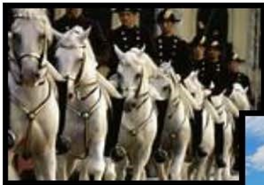
Experience Local Culture