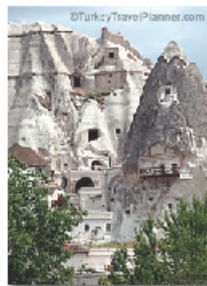
Cappadocian cave houses.