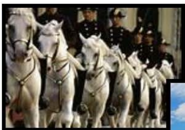
Experience Local Culture