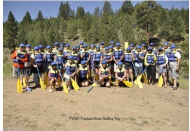
FWSA Truckee River Rafting Trip