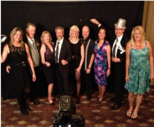
Rusty Bindings Club Delegates—2013