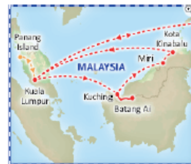
Borneo Adventure itinerary map