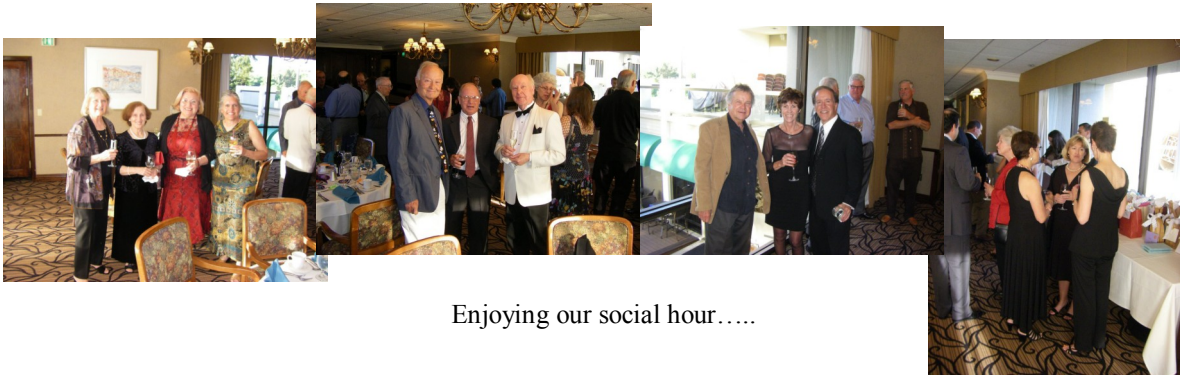
Enjoying our social hour.....