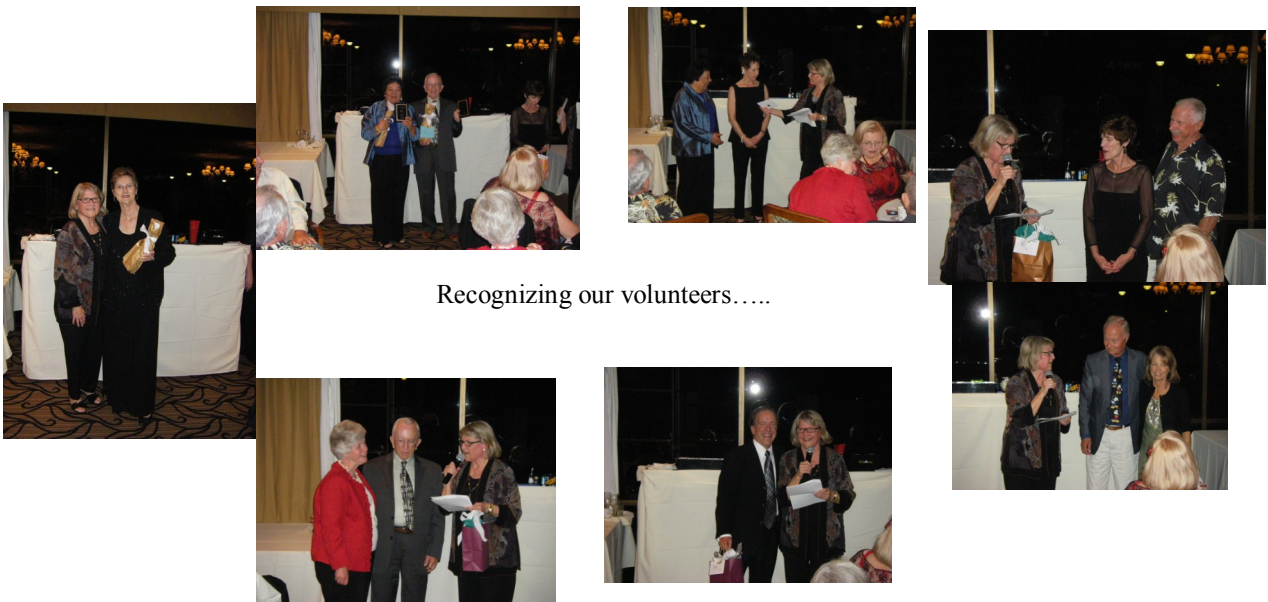
Recognizing our volunteers.....