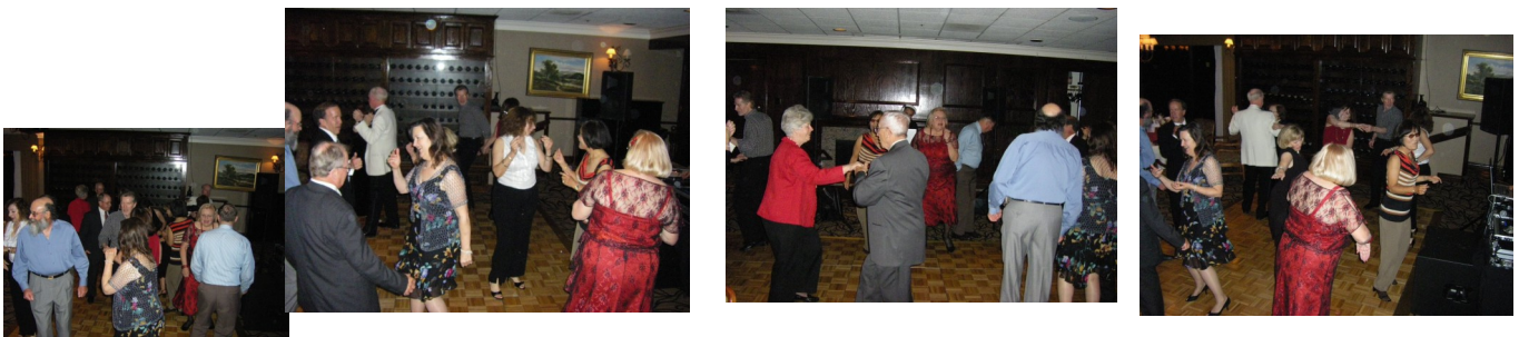
And we do know how to cut up a rug!!!!!! ("Dancin' the night away.....")