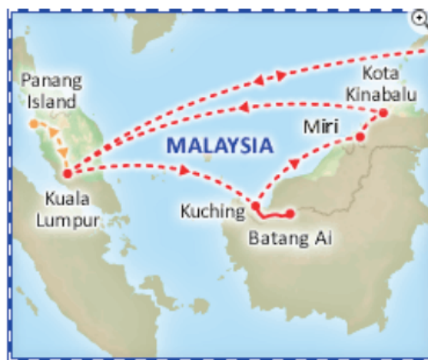
Borneo Adventure itinerary map