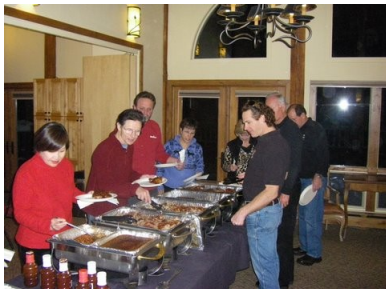
Tuesday we all enjoyed a delicious dinner!