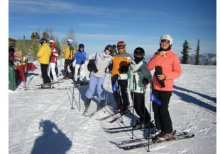
..... the snow!!!!

On January 21st 52 CVSC members arrived at a very snowy Snowmass, what a site. The remaining week when it snowed it snowed at night which made for great Colorado powder.