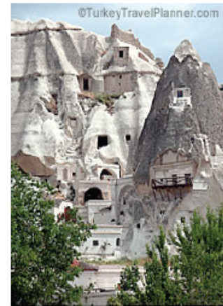
Cappadocian cave houses.