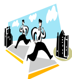
VOLUNTEER PARTY—OCT 17

(f)= flyer in this issue , (tt) = see travel table