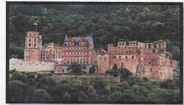
Enjoy Regional Cuisine