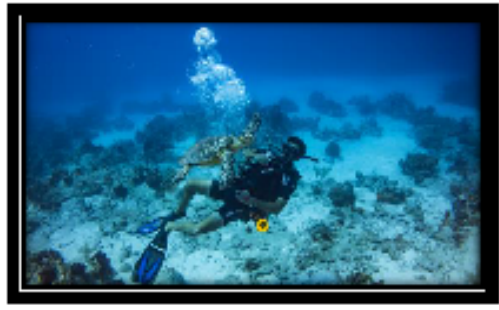
Dive the famous Bloody Bay Wall!

Create New Memories with Friends, Old and New!