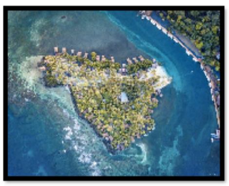
Díve, Kayak, snorkel, spa services and more...

Create New Memories with Friends, Old and New!