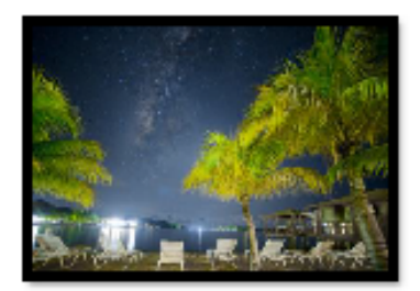
Experience Honduran Culture 5 Entertainment