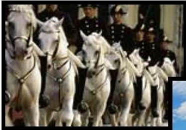
Experience Local Culture