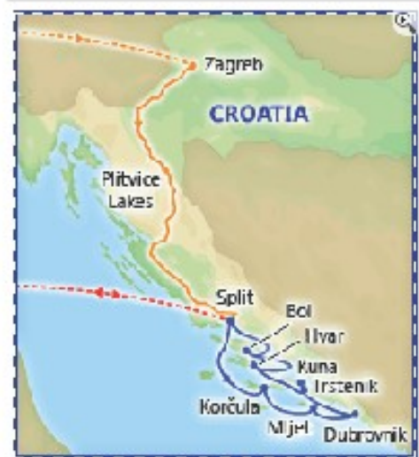
Croatia Cruise Adventure tour itinerary map