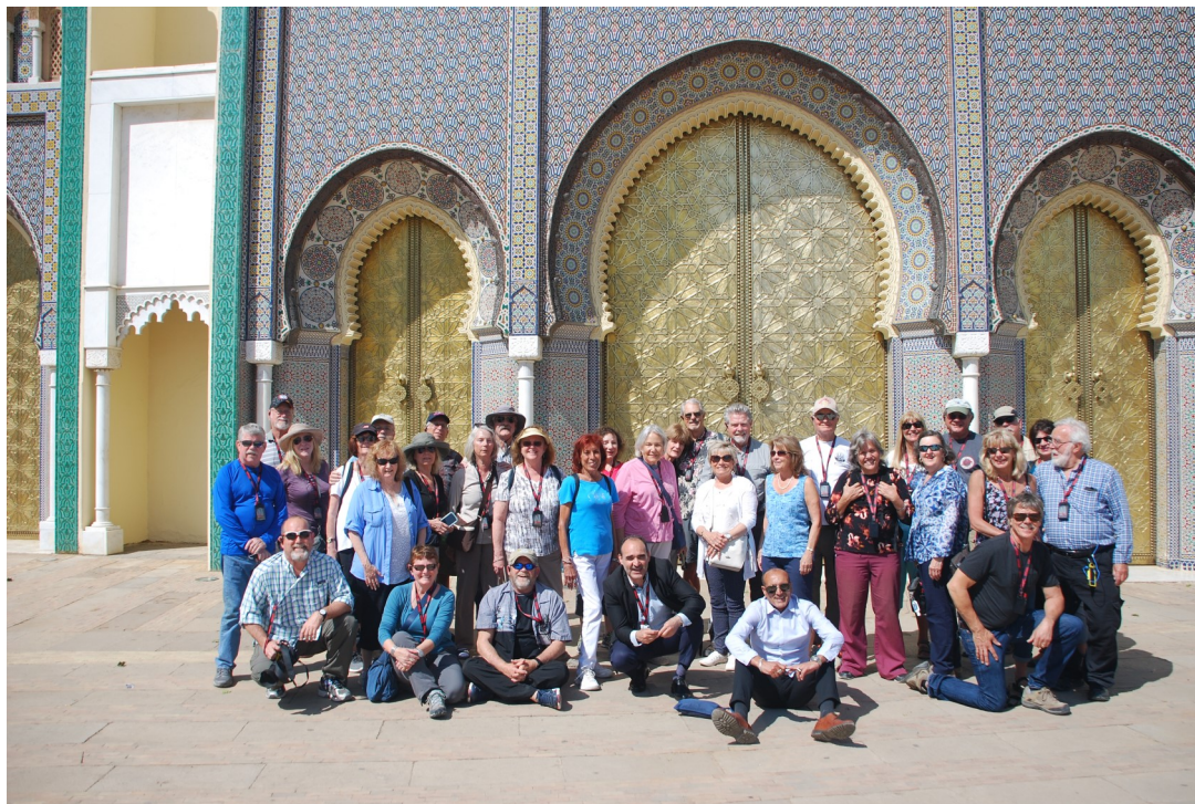
Standing in front of the entrance of one of many fine, ancient palaces we visited.