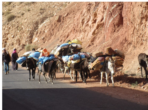
On our bus tour we were extremely fortunate to come across a nomadic tribe.