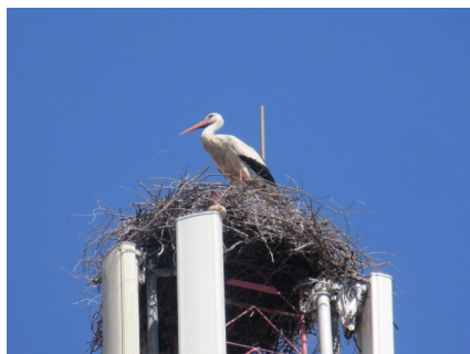
Storks in their nests perched atop a building tending to their young.

Morocco is a truly “majestic” land. One of much diversity — being mainly a Muslim nation but living peacefully along side Christians & Jews.