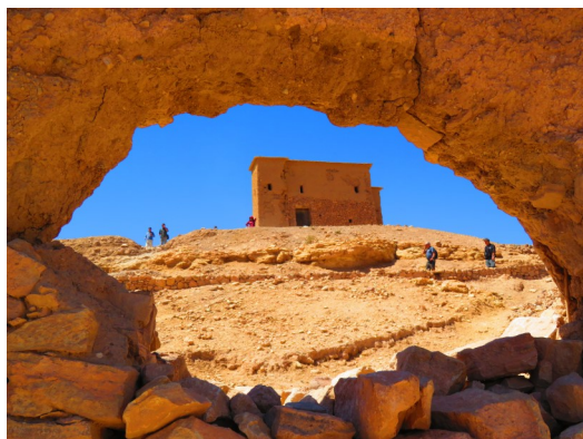
A keyhole view of an ancient grainery (no longer used).