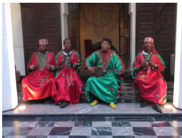
The natives entertaining the tourists.