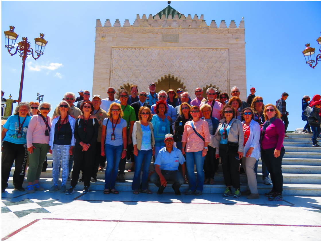
Standing in between the entrance of another ancient palace and a mausoleum.