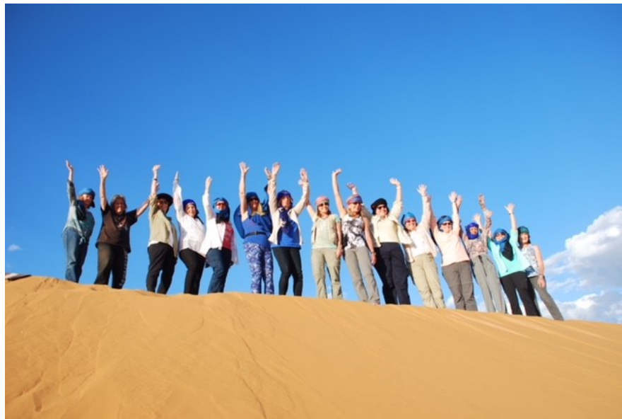
Us ladies on top of a sand dune waiting for the sun to set — then back on our camels to our camp.