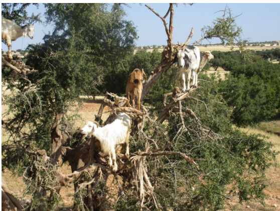
Somethin' got your goats??? (in trees yet)