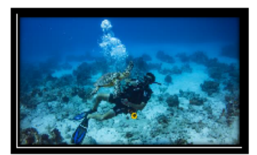
Dive the famous Bloody Bay Wall!