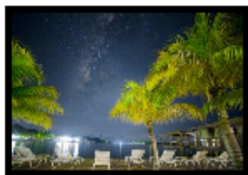
Experience Honduran Culture & Entertainment