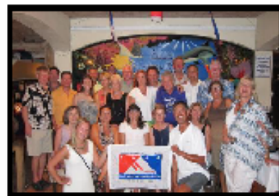
Enjoy a Beautiful Resort