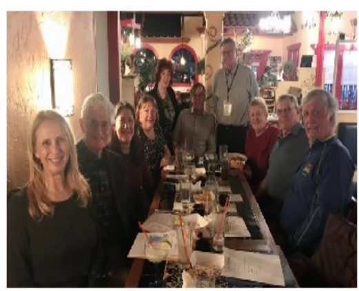
Attendees at the BAC Dinner Honoring our Club Volunteers of the Year