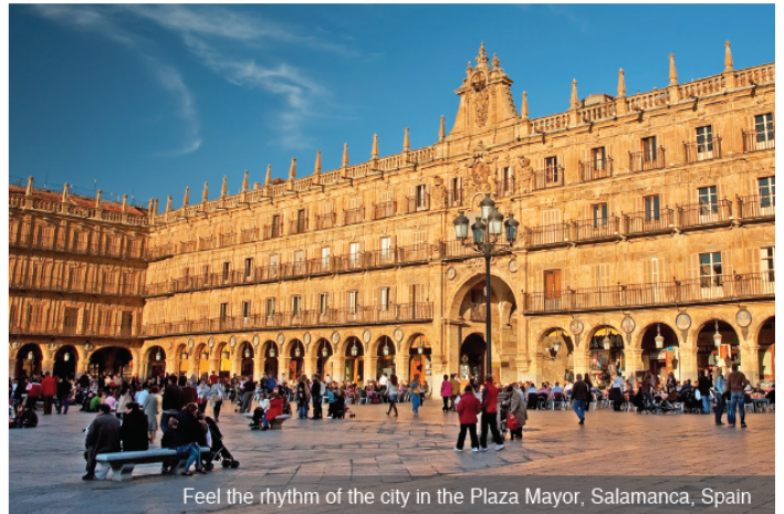
Feel the rhythm of the city in the Plaza Mayor, Salamanca, Spain

DAY 1 Depart the USA: Depart the USA on your overnight flight to Lisbon, Portugal.