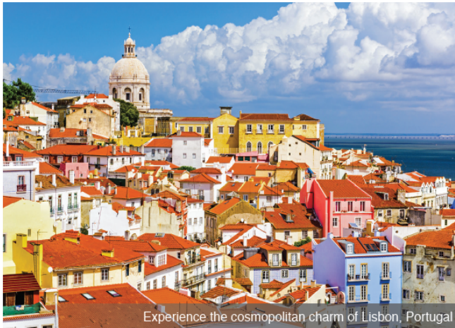
Experience the cosmopolitan charm of Lisbon, Portugal