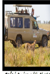
Safari Cruiser with Cheetah