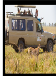
Safari Cruiser with Cheetah