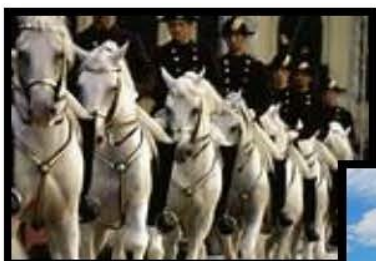
Experience Local Culture