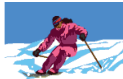
FWSA Ski Week Big Sky, MT Jan 24-31